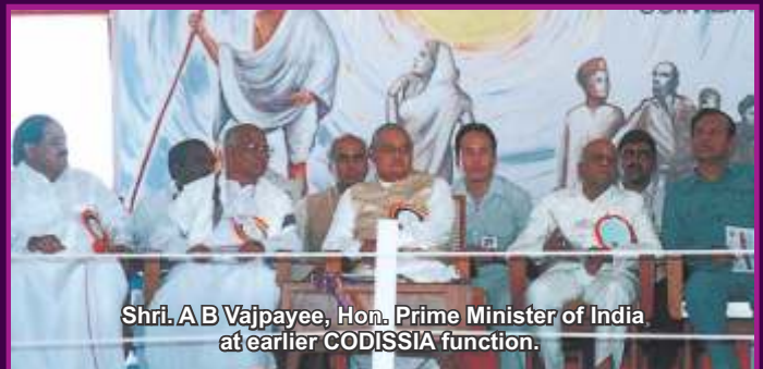
Shri. A B Vajpayee, Hon. Prime Minister of India at earlier CODISSIA function.