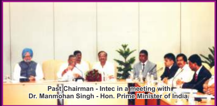
Past Chairman - Intec in a meeting with Dr. Manmohan Singh - Hon. Prime Minister of India.