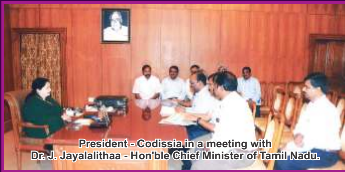
President - Codissia in a meeting with Dr. J. Jayalalithaa - Hon'ble Chief Minister of Tamil Nadu.