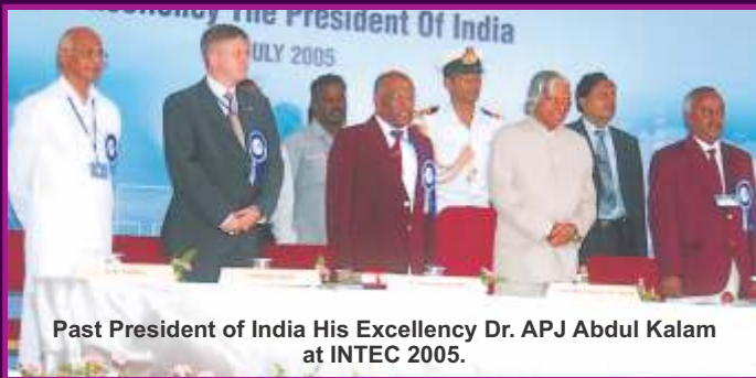
Past President of India His Excellency Dr. APJ Abdul Kalam at INTEC 2005.