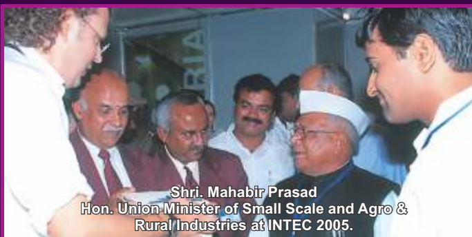
Shri. Mahabir Prasad Hon. Union Minister of Small Scale and Agro & Rural Industries at INTEC 2005.