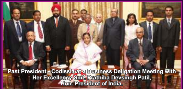
Past President - Codissia at a Business Delegation Meeting With Her Excellency Smt. Prathiba Devsingh Patil, Hon. President of India.