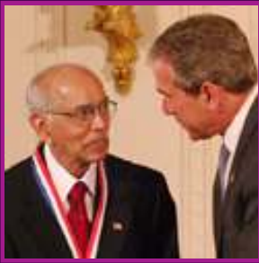
Prof. Dr. C. RADHAKRISHNA RAO Recipient of Padma Vibushan, Fellow of Royal Society of London (FRS), Head - Pennsylvania State University, USA. Scientific Advisor in Risk Analysis to US Government.