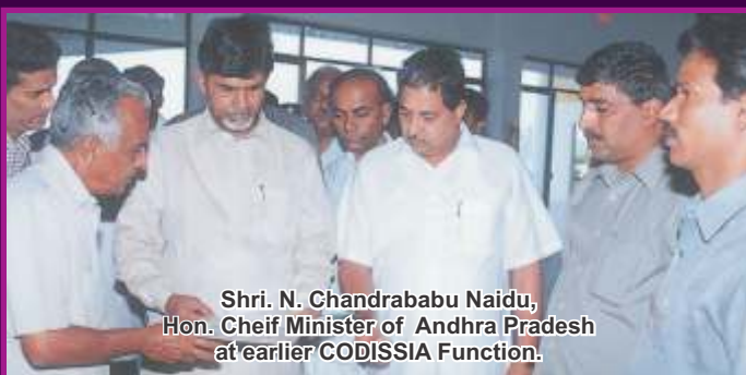
Shri. N. Chandrababu Naidu, Hon. Chief Minister of Andhra Pradesh at earlier CODISSIA Function.