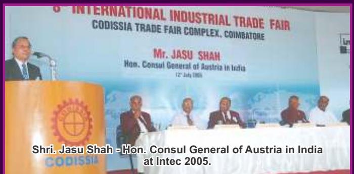
Shri. Jasu Shah - Hon. Consul General of Austria in India at Intec 2005.