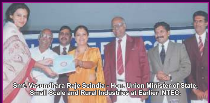
Smt. Vasundhara Raje Scindia - Hon. Union Minister of State, Small Scale and Rural Industries at Earlier INTEC.